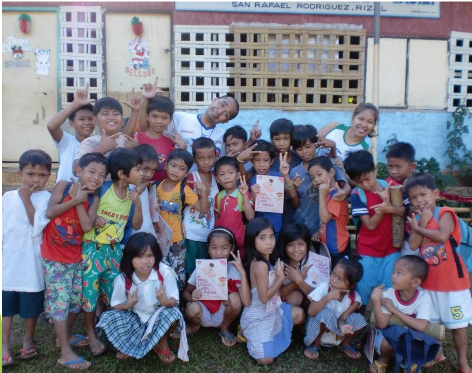
Casili and Inigan Elementary Schools in Sitio Casili, Brgy. San Jose Rodriguez, Rizal