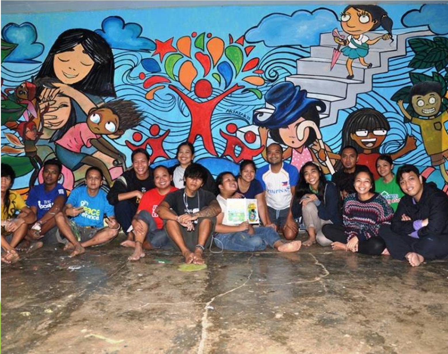
The painted walls of Pinalpal Elementary School's TSP Library.