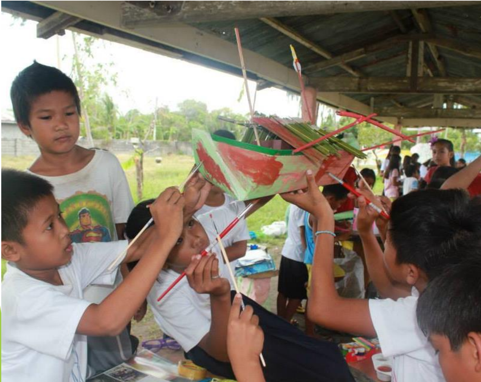
Suit Elementary School Sitio Suit, Pugaro District, Dagupan City