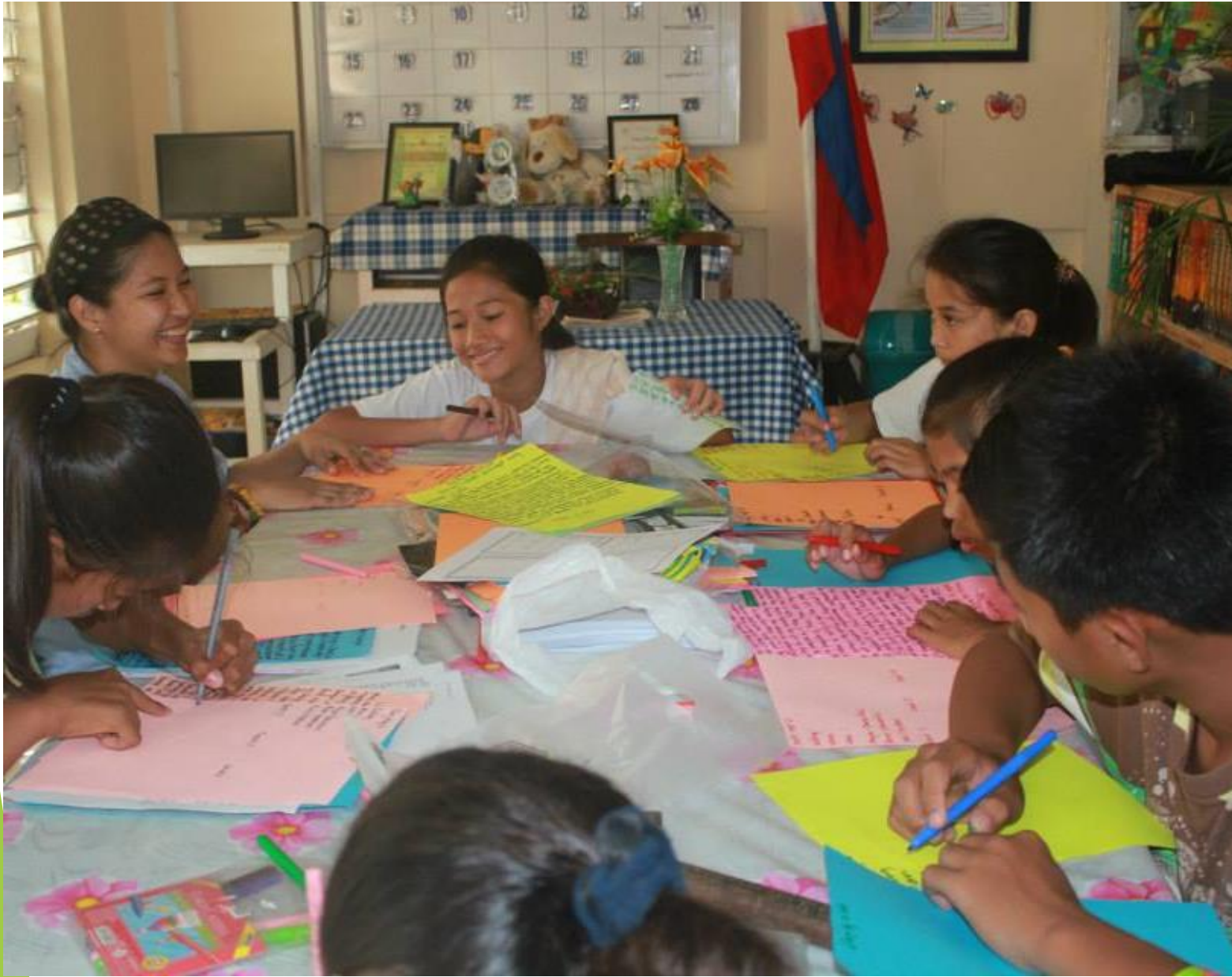
Story writing with the kids of Suit Elementary School Sitio Suit Pugaro District, Dagupan City