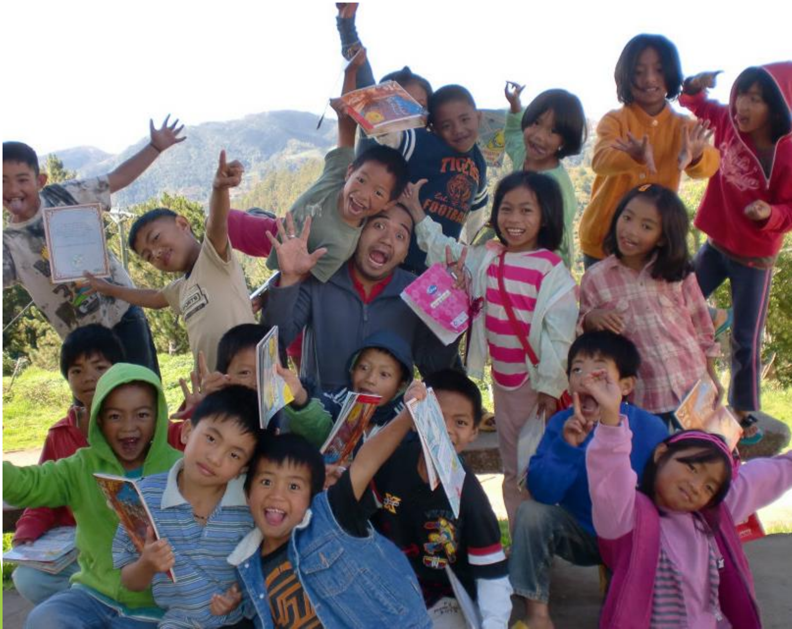
Pactil Elementary School, Sitio Pactil, Monamon Sur, Mt. Province