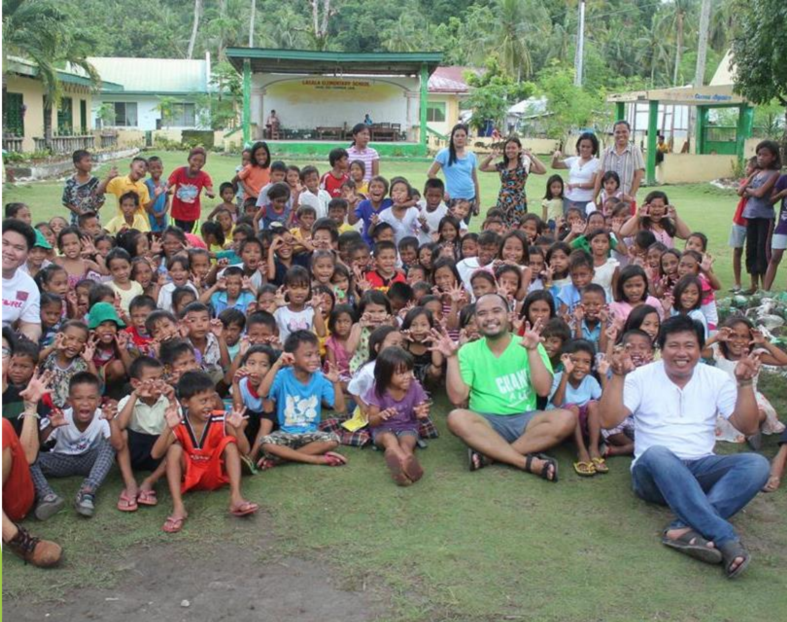
Storytelling Activity in Del Carmen, Siargao