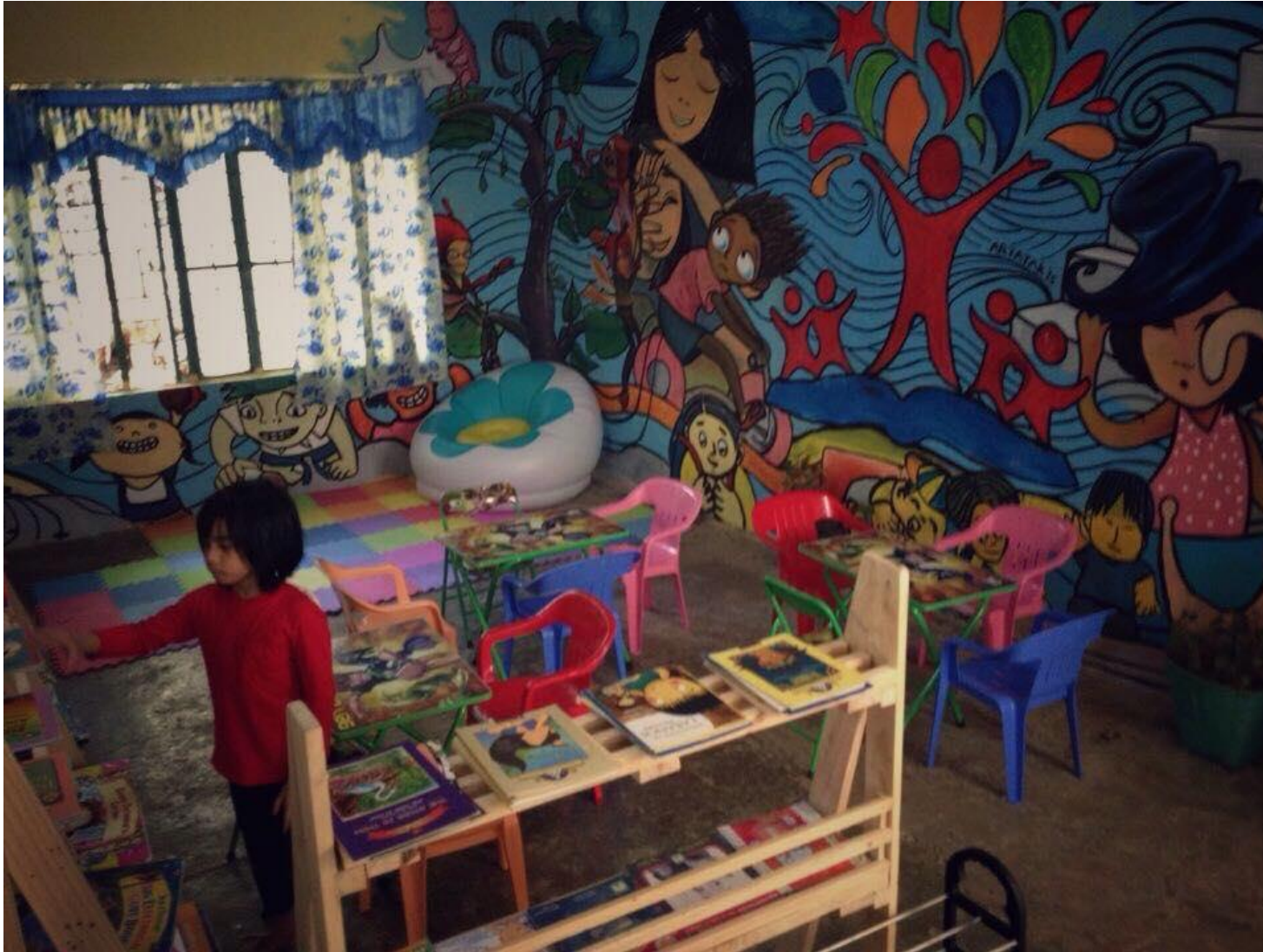
Pinalpal Elementary School's TSP Library.