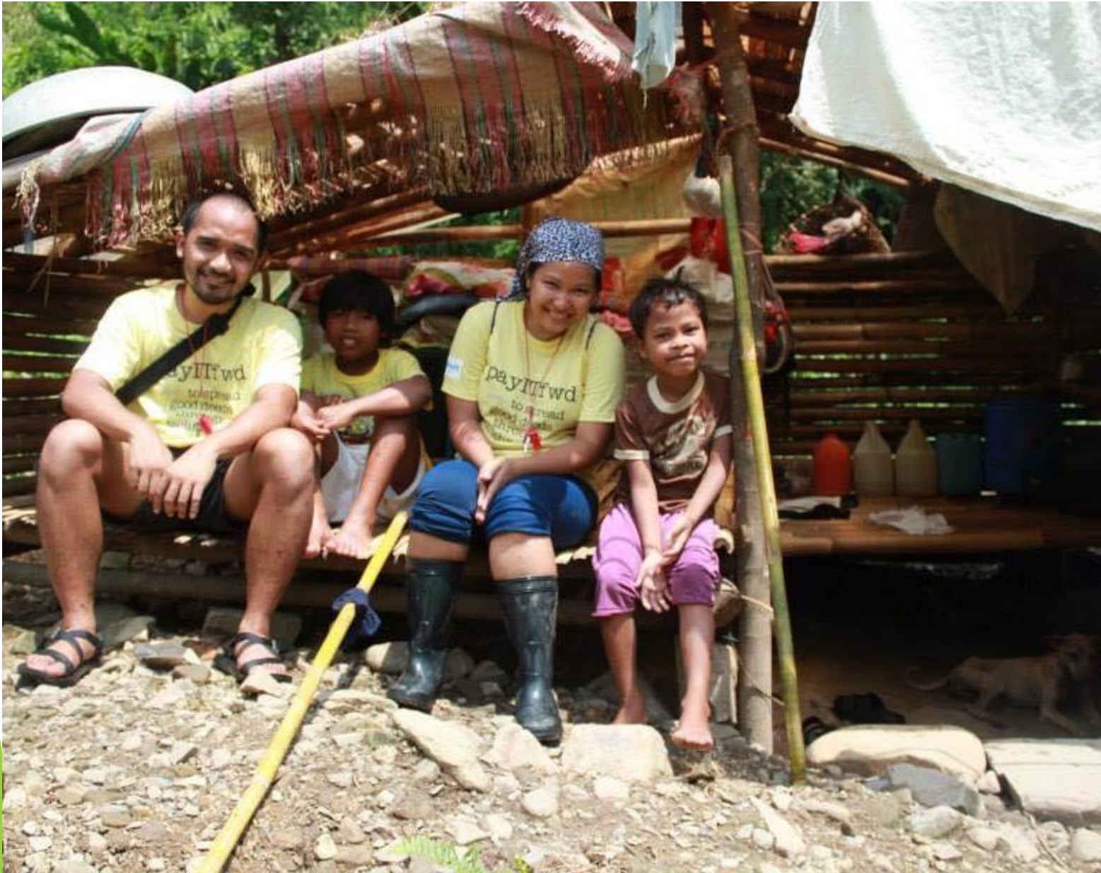
House visits in Purok Tayabasan, Sitio Ysiro, Brgy. San Jose, Antipolo City